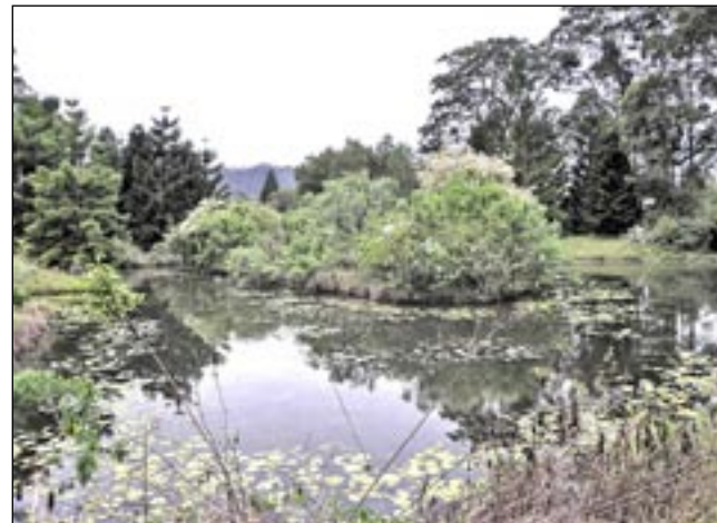
In the above image of the proposed parkland, the spillway from Aquarius Village can be seen entering the lagoon on the left, where the rocks are. Right: another part of the land.