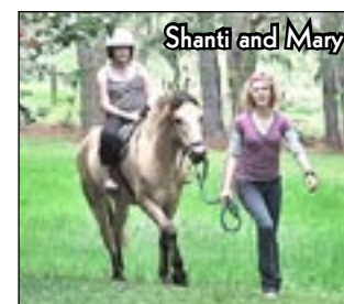
we're not sure which side won!

Live music added to the festive vibe. The rollicking revelries of the Roving Skillet Jug Band had many toes tapping, and hips swishing. The day ended with a traditional tug-o-war, and