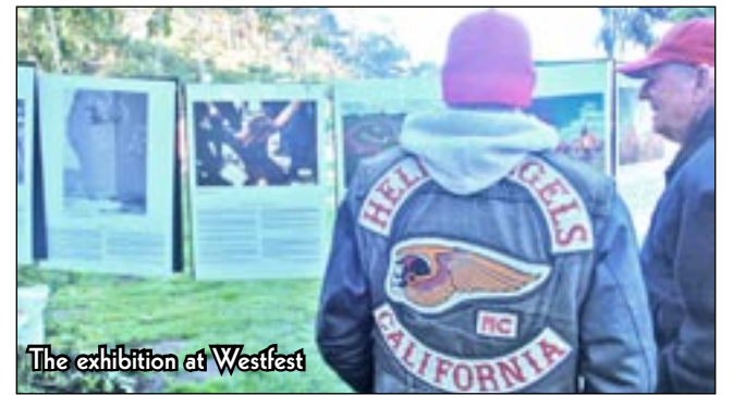
The exhibition at Westfest

Organisers hope to form a human mosaic on the day,