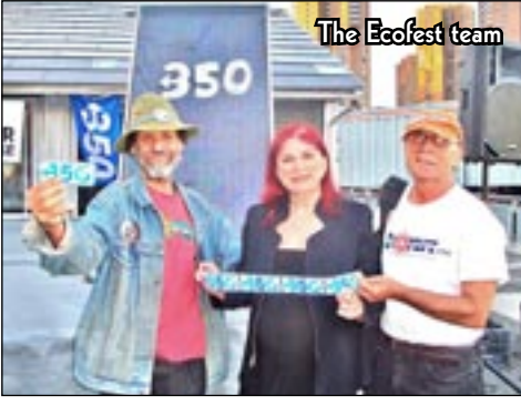
The Ecofest team

Now that the Federal elections are over in Australia, I ask you all to get behind this action and contact either your local member, The Greens or the Prime Minister to install on October 10th, solar thermal (hot water) panels on either Parliament House or The Lodge, better still both, and the Governor General to install them on Government