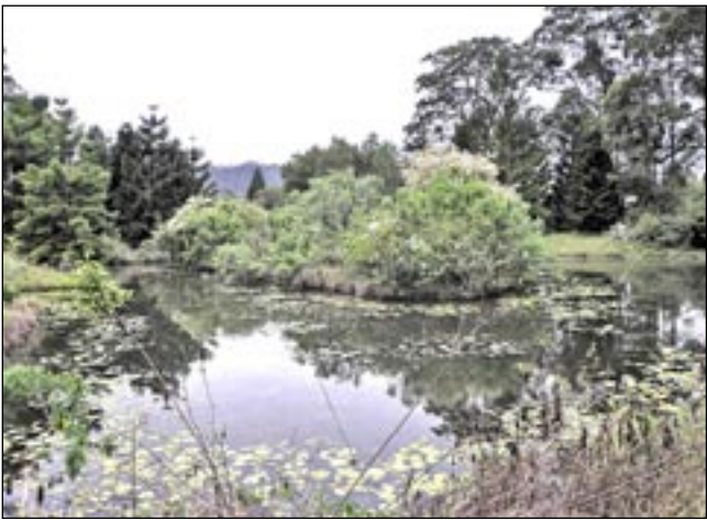
In the above image of the proposed parkland, the spillway from Aquarius Village can be seen entering the lagoon on the left, where the rocks are. Right: another part of the land.

Friends of Nimbin Village Park is a group of local residents who feel passionate about establishing public parkland in the village centre. The parkland is envisaged