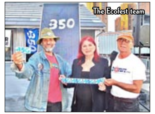
The Ecofest team

Now that the Federal elections are over in Australia, I ask you all to get behind this action and contact either your local member, The Greens or the Prime Minister to install on October 10th, solar thermal (hot water) panels on either Parliament House or The Lodge, better still both, and the Governor General to install them on Government