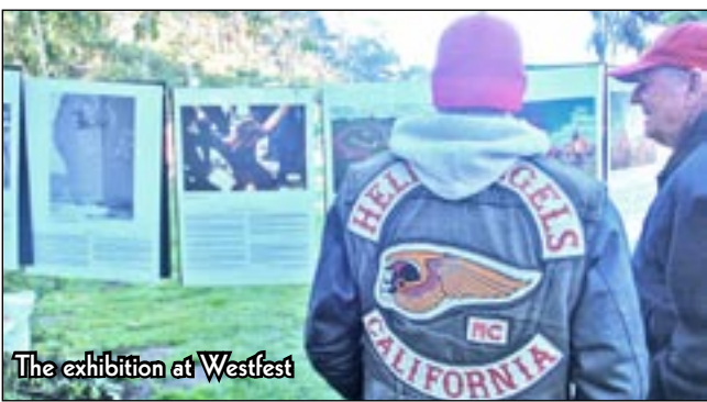
The exhibition at Westfest