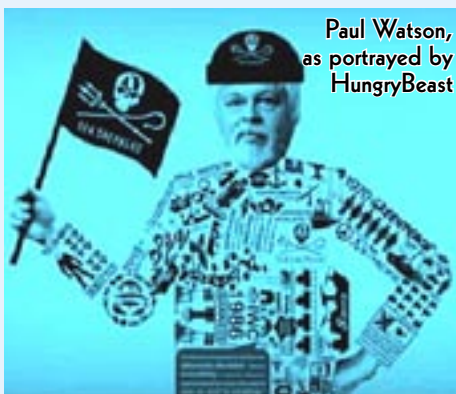
Paul Watson, as portrayed by Hungry Beast

One day when we looked out on to the ocean, about twelve or more whales filled the view as far as you