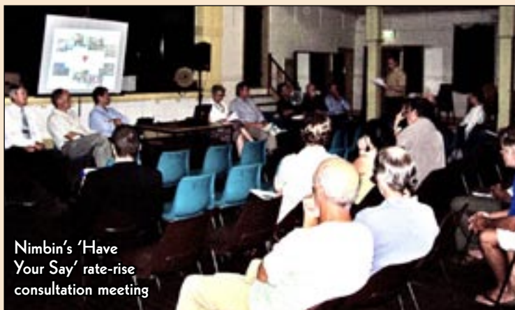
Nimbin's 'Have Your Say' rate-rise consultation meeting