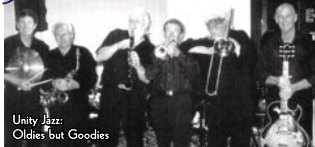
Unity Jazz: Oldies but Goodies