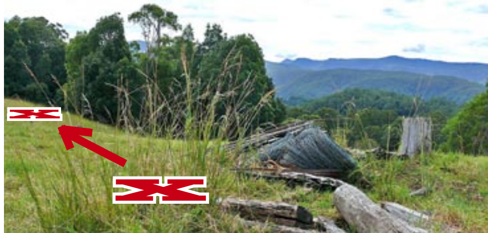
X marks the spots. The preferred paddock for the police communications tower, on top of the ridge at Rose Road. The ridgelines of Wallace and Young Roads can be seen in the background.

Residents on Rose Road, Nimbin have been notified of Police intentions to construct a communications tower on the ridge, close to several houses, in an area with rural residential zoning.