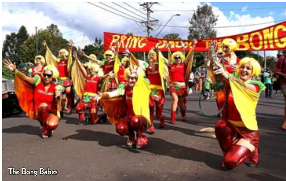
The Bong Babes

However I was very positive regarding the overall policing of the event. Despite their inflated numbers, the tenor of the policing was much better than it has been in recent years. This was reflected in fewer arrests and a much happier event. And more significantly, it has gone a long way towards bringing back some respect for the authorities amongst the event organisers and those attending. This