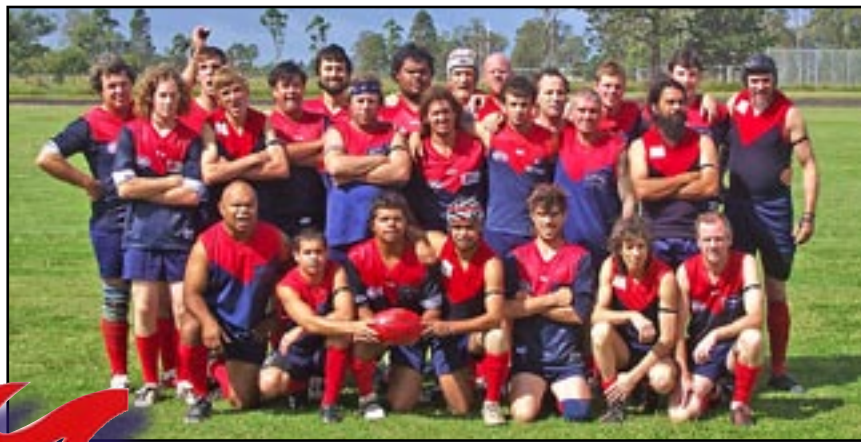
A keen Nimbin Demons team in 2008

Representatives from Coolangatta have indicated their intentions to create a new club in the Northern Rivers area, with the purpose of fielding a team in the Brisbane Football League, where the competition is probably stronger than