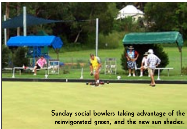
Sunday social bowlers taking advantage of the reinvigorated green, and the new sun shades.