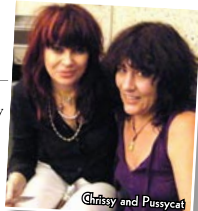
Chrissy and Pussycat

out some classic Divinyls numbers, which played out the story of her career, and the volatile romantic relationship between herself and former Divinyl Mark McEntee.