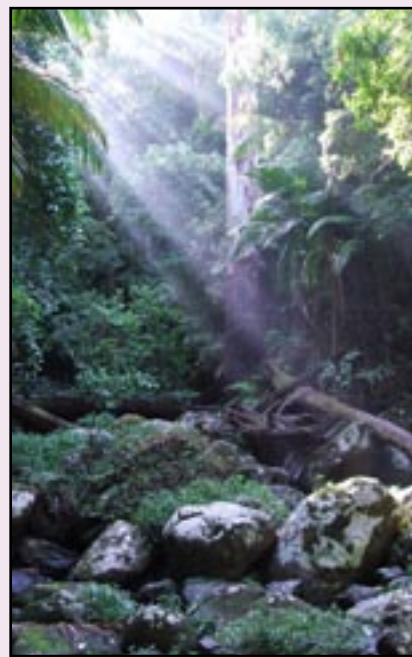
One of the remnant sites covered in this ground-breaking project.

Rehabilitation work was undertaken at 83 remnants of endangered lowland