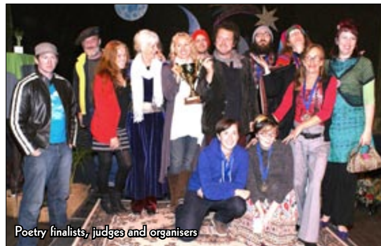
Poetry finalists, judges and organisers

Critics acclaimed the standard of performances, and one of the judges wished that the first prize could have been awarded to all