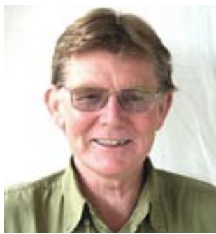
by Simon Clough Lismore City Councillor

Wow! What a full on month it has been for your local government representatives.