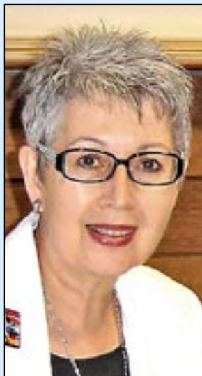
by Jenny Dowell Mayor of Lismore