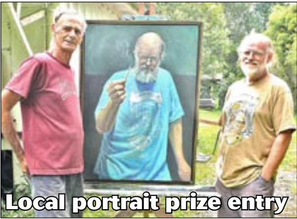
Local portrait prize entry

But who are we anyway, I wondered? Who are you? People who were plumbers all their life and lost their jobs often go into crisis. Who are they now? They get up in the morning, get dressed in the plumber overalls but there's no work to go to and they sit bewildered and lost. Many curl up and die soon after retirement. Separated from their jobs they have no idea who they are. Who are you? I'm a plumber. Oh. Well right now I'm a bum. Homeless, but never without a smoke or the mobile you'd notice if I let you, which I won't. And what a beautiful carefree no responsibility life it is. I may never change character. And all I have to do this month is keep an eye on the Council's Tourist Information Centre for them, to make sure they don't promote Mardigrass in any way.