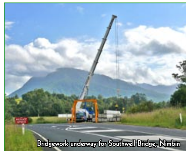
Bridgework underway for Southwell Bridge, Nimbin