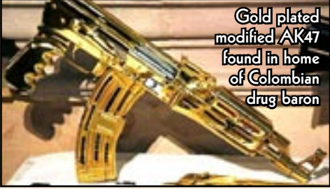
Gold plated modified AK47 found in home of Colombian drug baron

Neighbouring Venezuela is complaining that the US military build-up (five new military bases, mostly near the Venezuelan border) is not about the war on drugs, but about destabilising Venezuela, which is engaging democratically in a socialist