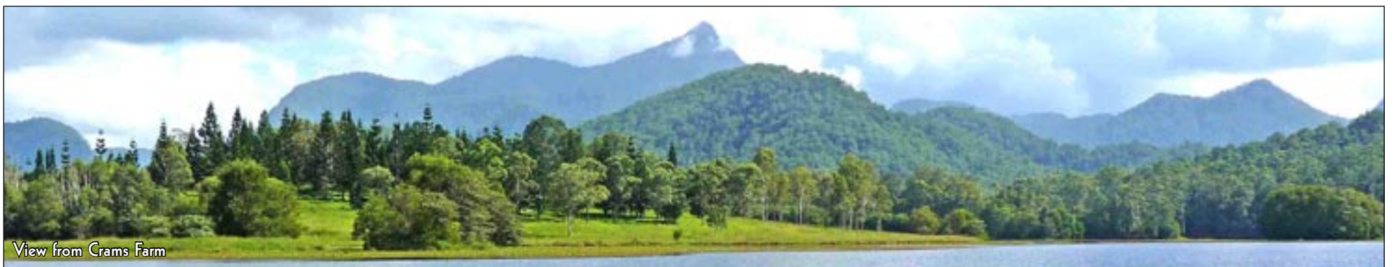
View from Crams Farm