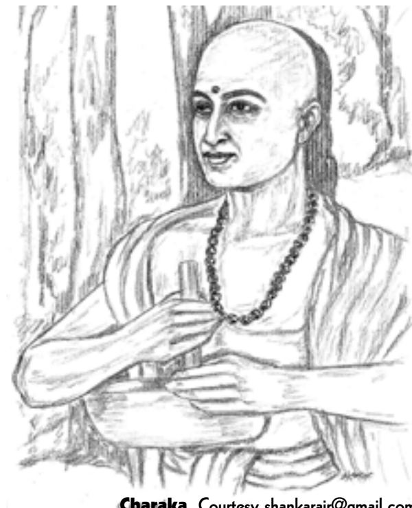
Charaka.

This month we thought we'd talk about one of the major personalities of early Ayurveda – Charaka. He is credited with the earliest written medical text, knowledge which had previously been transmitted orally. He lived at a time of much debate between the various philosophical arms of Indian thought and recognised that his system of medicine had to be built on philosophical foundations which would resist change while the superstructure would wear and change over time. Medical knowledge had always existed in folk lore, local traditions, verbal testimony, the Vedas and many other sources. Sages from China, Tibet, Greece, Afghanistan and Persia came to learn the wisdom of Ayurveda and return with it to their countries.