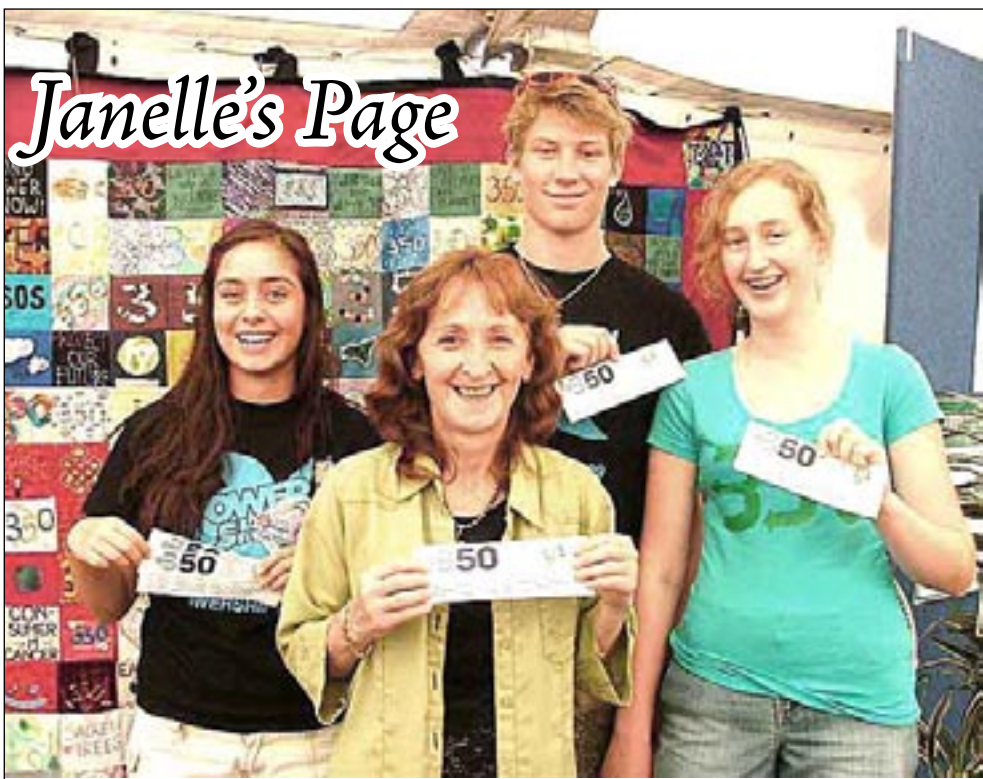
by Janelle Saffin, MP