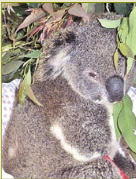
Poppy, a typical retrovirus koala brought in from Tucki. Thin and dehydrated, the only external sign of clinical disease was mild cystitis. Bone marrow samples confirmed leukaemia. Poppy was 2 years old but weighed only 3 kgs.

The Australian Wildlife Hospital is conducting field studies investigating the prevalence and incidence of disease in two koala populations in south-east Queensland. Dr Jon Hanger, Director of Research and Ecological Services at the Hospital and whose work for his PhD thesis, An investigation of the role of retroviruses in leukaemia and related diseases in koalas , isolated the retrovirus, believes that koala retrovirus infection modifies the immune response in some infected koalas leading to increased susceptibility to development of chlamydial disease following exposure to the organism and resulting in a higher likelihood of severe, debilitating (or fatal)