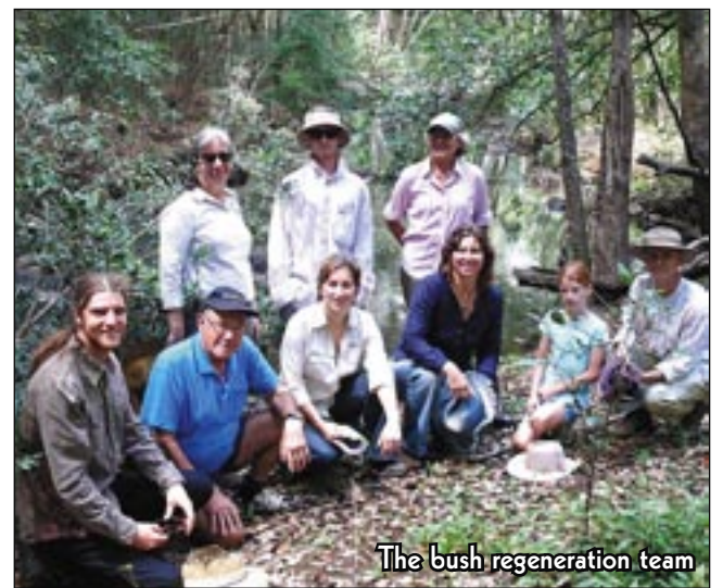
The bush regeneration team

Since 2007, a team of bush regenerators have been