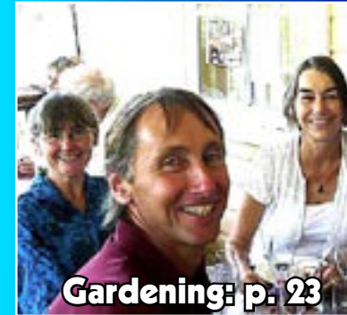
Gardening: p. 23