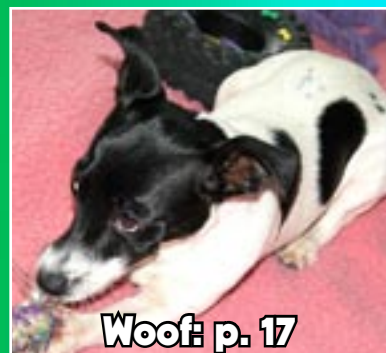
Woof: p. 17