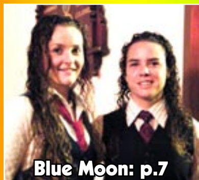
Blue Moon: p.7