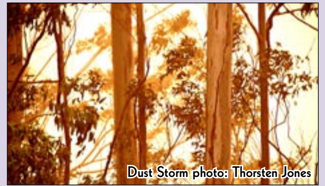
Dust Storm

Wednesday 14th October, 6pm at Nimbin Neighbourhood and Information Centre (Elmo room – come to back stairs). Bring a plate of nibbles to share.