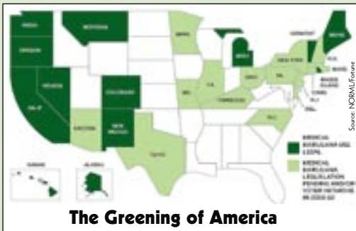
The Greening of America

Since the new approach was signalled, 13 states now have laws that let residents use