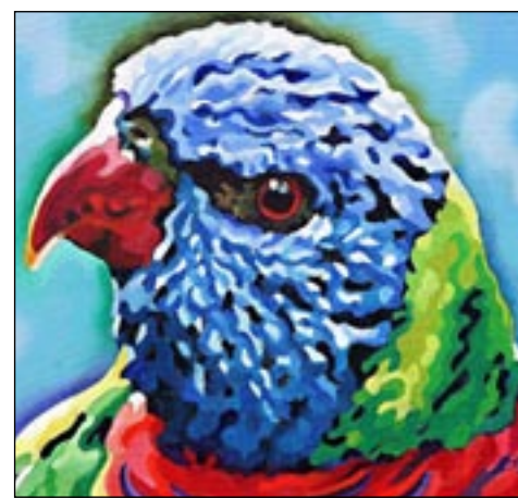
Top to bottom: Lorikeet Study 2 by Rikki Fisher, Greeting the Dawn by Katherine Castle, Yellow tails by Vida Pearson.

The Wild Side exhibition was opened by Lorraine Vass (pictured) on 2nd October and runs until 29th November. It is open Thursday to Sundays, 10am-4pm at Blue Knob Hall Gallery and Café, 719 Blue Knob Road, just 10 minutes from Nimbin.