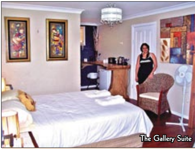
The Gallery Suite

That secluded motel at 360 Croftons Road, Nimbin has just been re-opened after a major re-fit, which has seen it transformed into boutique accommodation and named Croftons Retreat .