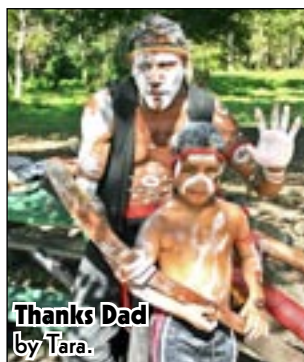
Thanks Dad by Tara.

The judge, Peter Hunter OAM, ARPS, AFIAP said he was very impressed with the creativity shown by