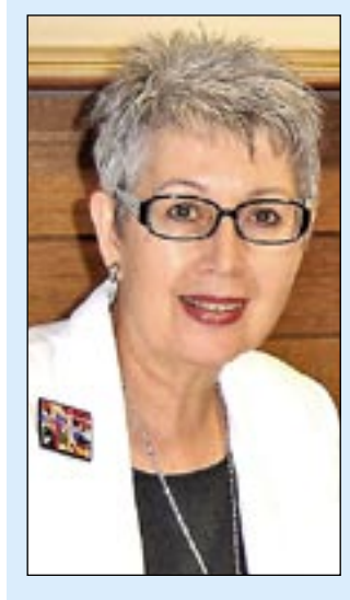
by Jenny Dowell Mayor of Lismore

It's a shame that the public meeting to discuss the development was on such a miserable evening with few venturing out in