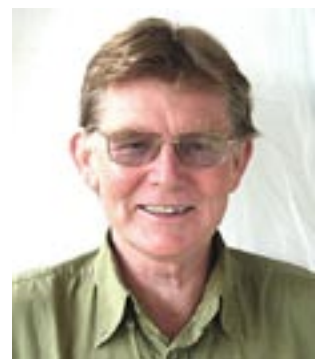
by Lismore Councillor Simon Clough

Tow things change in a Honth. Last month's column opened with "It was great to have all that rain and no serious flood". Today I've changed my mind – it's great to have that glorious Autumn sunshine, and what a helluva flood we've just had.