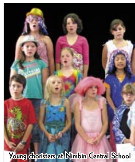
Young choristers at Nimbin Central School

If your angel is complaining about headaches or sore backs they may have compromised their neck or spine during one of those activities when they were