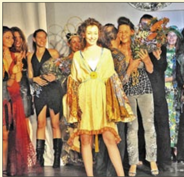
Nimbin's fashion community at the Nimbin Fashion Shows.

We may need to form a Nimbin Fashion Collective to access some funding to develop a more sustainable business in fashion. As a