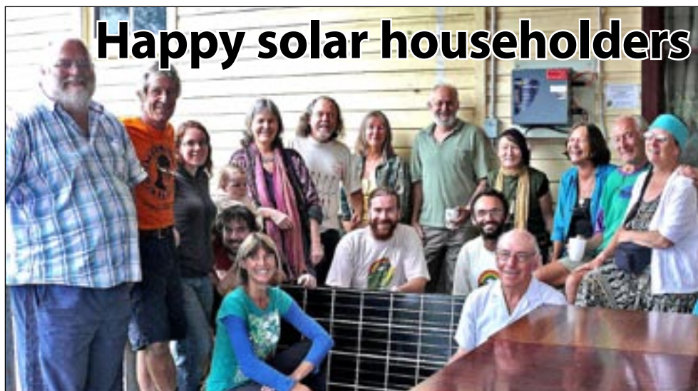
Some of the 55 householders who now have solar grid feed systems on their roofs through the Nimbin Solar Packaging Project, co-ordinated by the Nimbin Neighbourhood Centre and installed by the Rainbow Power Company, taking advantage of federal government rebates and bulk supply pricing.