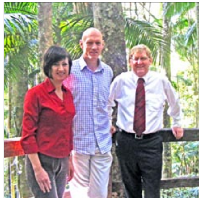
Regional initiatives. Justine with Minister for the Environment Peter Garrett MP and Minister for Tourism Martin Ferguson MP at the launch of the eco-tourism strategy, Green Caldera.