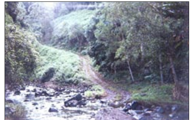
Re-gen. Wirriga community, where an Envirofund project, funded by the Australian government, involved planting both sides of the track.

Work days: Tues, Wed, Thurs, Fri. Volunteers