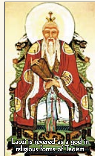
Laozi is revered as a god in religious forms of Taoism

Nimbin. Nimbin tolerates people who are considered "bad" in many other places. Just as The Dao said: "Always try to respect people, so there is no one to chase away... and always repair so nothing needs to be thrown away."