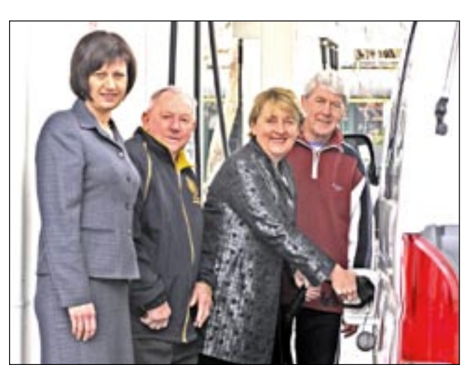
Fuelling up. Justine with Jenny Macklin, Minister for Families, Housing, Community Services and Indigenous Affairs and two volunteers.

Following a review of the first stage of the loans, Stage Two would provide the remaining $150 million in loans and the balance of the places. The review will examine the effectiveness of the first round and nominate areas for refinement such as