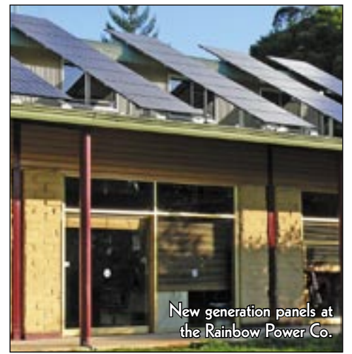
New generation panels at the Rainbow Power Co.

If you previously registered and have not