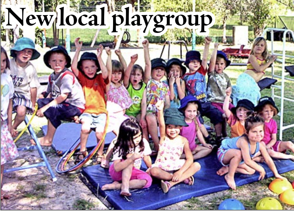
Mondays 9.30 – 11.30am at Nimbin Community Preschool, Cecil Street, Nimbin

Stuck for something to do with the kids on a Monday morning? Thinking about the transition from toddler to teenager? Or just want to check out your local preschool from the inside?