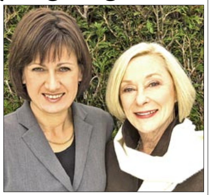
Richmond MP and Minister for Ageing Justine Elliot (left) with Australia's first Ambassador for Ageing, Noeline Brown.

There was an increasing demand, meaning that Australian government expenditure on aged care could rise from the current three per cent of total Commonwealth revenues today to nine per cent by