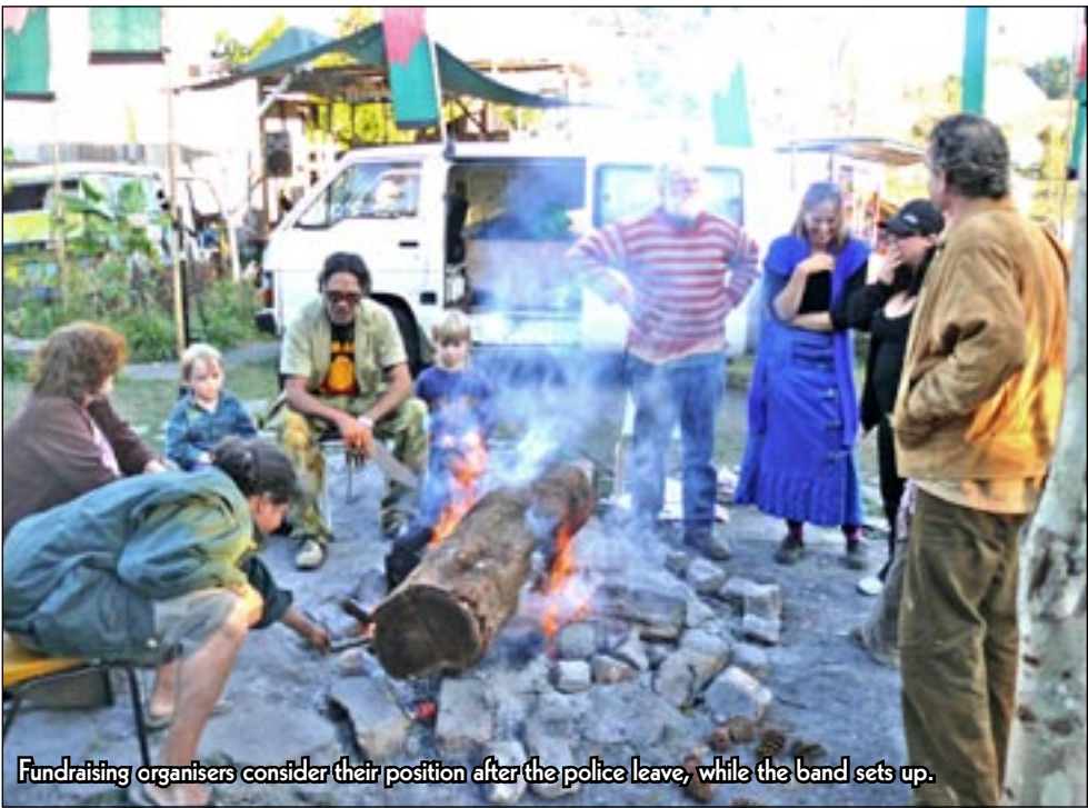
Fundraising organisers consider their position after the police leave, while the band sets up.

The fundraiser for the Nimbin Rocks Ngalingah Land Council roadworks, actually to make a half decent road entrance, was a great success on Saturday evening behind the Museum in Mingle Park.