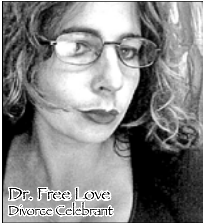
Dr. Free Love Divorce Celebrant

Honey lets face it-sounds like you have intense sexual chemistry and that is certainly nothing to do with anyone else. Keep the kinky stories to yourself as most people wouldn't like to admit they would get off on spanking and degrading a police officer of the law as this would be dishonoring and abusing those gracious knights who make our town safe at night (at least one night of the year) and are