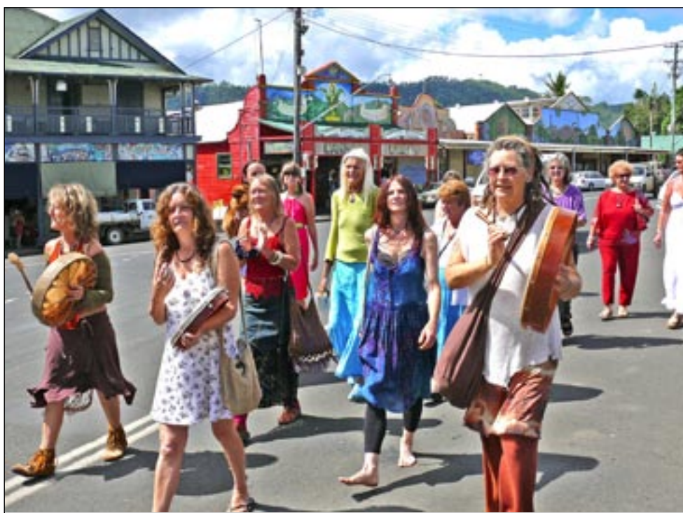
Banging the drum for women's rights. The International Women's Day march in Nimbin was celebrated with drums and whistles, and was applauded by the men on the footpath.

The talk is of another gathering in a couple of months, perhaps full moon, maybe afternoon into evening, possibly at the newly revived Bush Theatre. As you can see, the plans are loose and open to your input. If you want to be involved, call Raine on 0427-336-910.