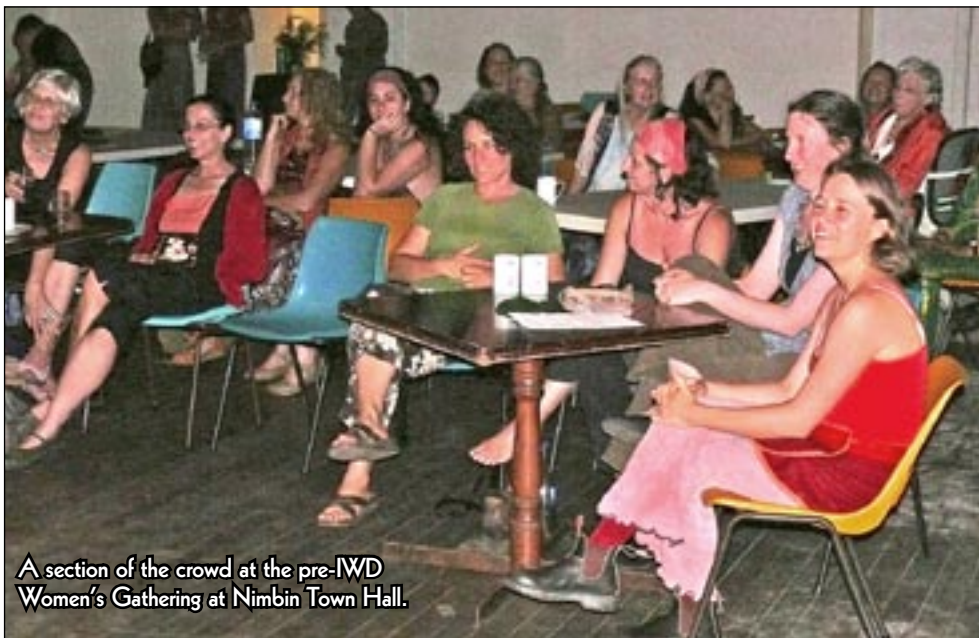
A section of the crowd at the pre-IWD Women's Gathering at Nimbin Town Hall.