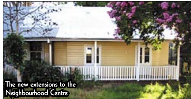
The new extensions to the Neighbourhood Centre

Nurse Practitioner position to provide community-based services to clients with a dual diagnosis (mental health issues as well as drug and/or alcohol issues).