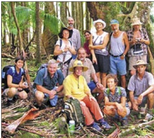
Keep on treckin' The bushwalkers in Wanganui Gorge.

Nevertheless, I reckon that it is much more fun walking with a mob like Nimbin Bushwalkers Club Inc., cause, amongst other things, there is so much expertise - and humour. So, give it a go. We don't go too fast. There is a tendency to dawdle, bird watch, photograph flowers and toadstools, chat and enjoy it all. Visitors are always welcome. Happy New Year of the Waterfall.