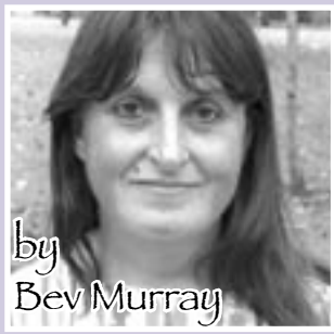
by Bev Murray