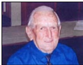
19th February 1921 – 22nd September 2007 Much loved by the Nimbin community Rest in Peace

reading everything you write. This meant that I didn't pick up that the vital words "Pensioner Concession Card" had been deleted by my computer. It also seems that I had confused "Disability Pension Concession Cards" information with "Seniors Cards".