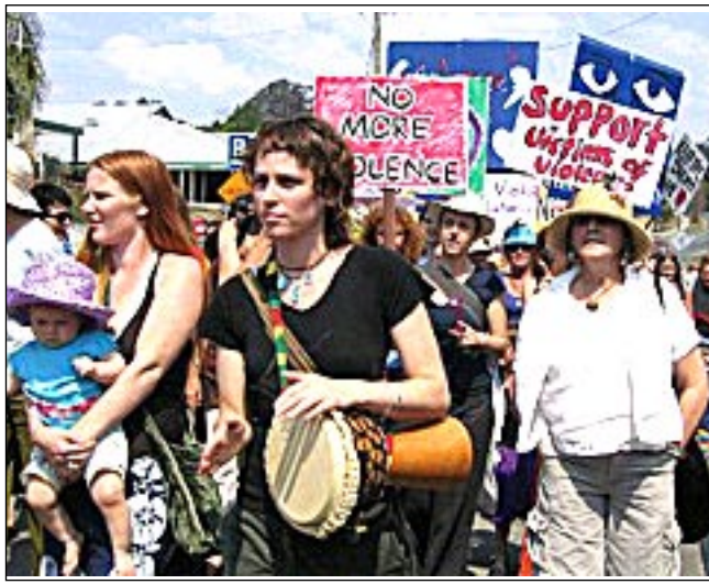
Noisemakers. Last year's Reclaim the Night march in Nimbin.

Reclaim the Night was started by Italian women in Rome in 1976 as a reaction to the increase of sexual assaults in that town and the lack of response to the crimes by the authorities.