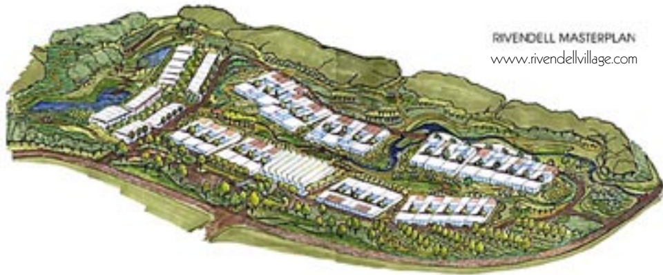
RIVENDELL MASTERPLAN www.rivendellvillage.com

The Development Application for "Rivendell Village" was advertised in the NR Echo on 1st November.