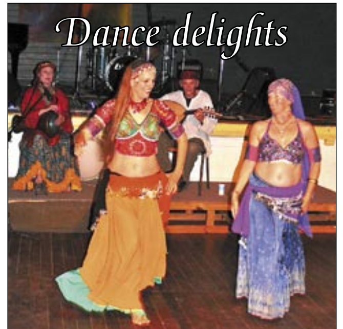
The 15th Annual Concert of Dance is on Friday 23rd November in Nimbin School of Arts Hall. The Nomads (some above) will be there!

So there we are folks. What the hell IS happening about Mulgum?