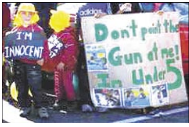
Vocal opposition. Kids protest the raids at a street march in Whakatane, NZ.

Treaty guarantees Maori rights etc, but the underside is fierce Pakeha (white) backlash, and a prevalent red neck attitude of 'development at all costs'," he said.