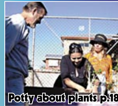
Potty about plants p.18