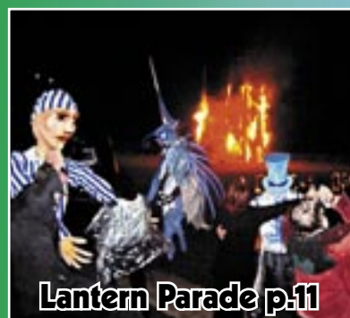
Lantern Parade p.11