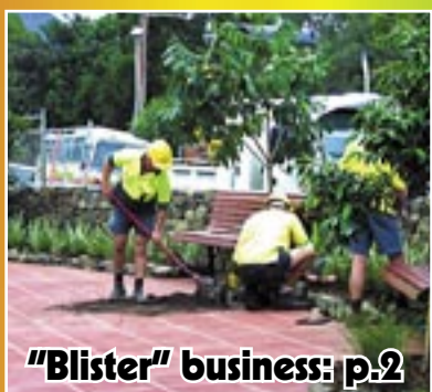
"Blister" business: p.2