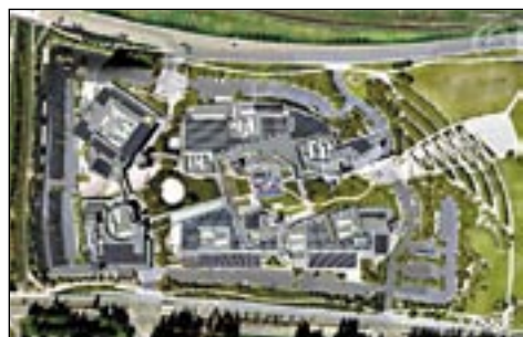
Redefining corporate goals. Plans for Google's new headquarters, which is to have a 1.6 megawatt solar electric installation.