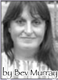
by Bev Murray

These are the fun-loving, knowledge seekers of the Zodiac! Usually coming into their own later in life than most they have more of their fair share of interesting stories to tell! They are loyal, spiritual and generous. Others can find them difficult to understand. They love travel and they must have independence! Give them: An adventure holiday, an adventure DVD, and an intimate party with wine and philosophy somewhere in there!