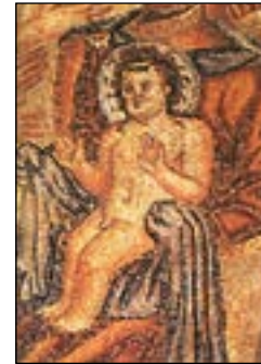
Many gods to celebrate (from top) Isis, Dionysus, Isis again, Mithras and a pre-Christian "Holy Child".