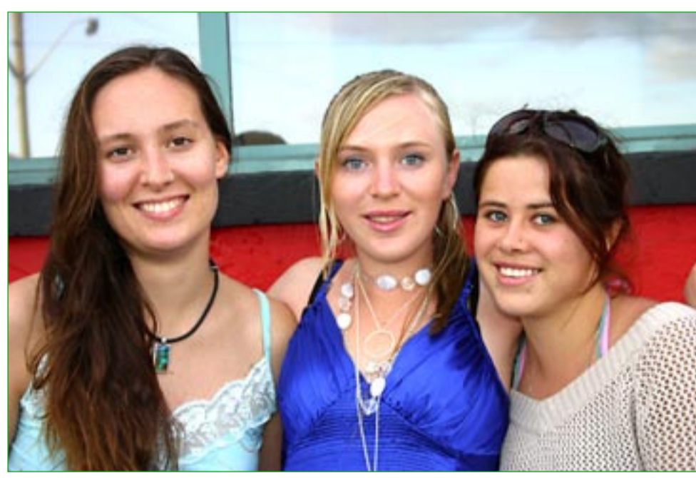
All set to go. Nimbin Central students arriving for their formals. See also story page 7.

occasion, and goes the extra distance to ensure everyone has a good time! The focus here is really on the people, and these seasonal parties bring together many old friends, and members of the extended family. People no-one's seen for ages come down out of the hills, out-of-towners and expats are visiting, and there's so much to talk about. The goss is good, and everywhere earnest knots of party-goers can be seen ignoring the dancefloor to sit on verandahs, just catching up. A common remark, "I can't believe the year's nearly over." So come one, come all, let's party our socks off, whether it be at the School of Arts, the pub, the Bowlo, in any one of the village halls around the hills, or in a garden somewhere. But let's do it safely - we want to see everyone back again next year. Compliments of the season to all our readers, and best wishes for the New Year, from the sponsors, contributors and staff of the Nimbin GoodTimes .