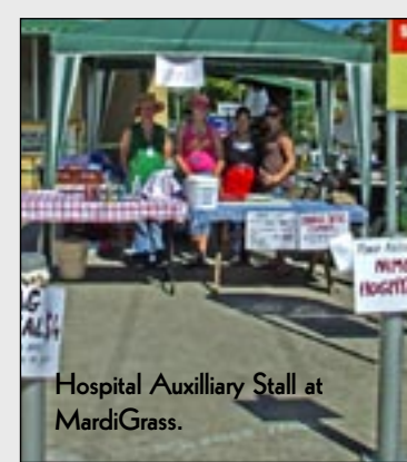
Hospital Auxilliary Stall at MardiGrass.