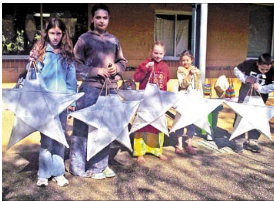
Primary students at Nimbin Central School are doing lantern-making workshops.

There was a very happy buzz in the air all day, and surely no-one will forget this special occasion. The feedback from parents, ex-students, teachers and students was so overwhelmingly positive that a repeat next year seems to be a must.