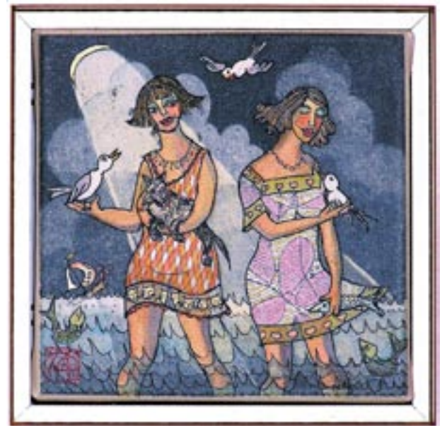
Angela Gill - Moonlight Escapades I

Helena Herendi's beautiful felt wall panels entitled 'Palimpsest I & II' are