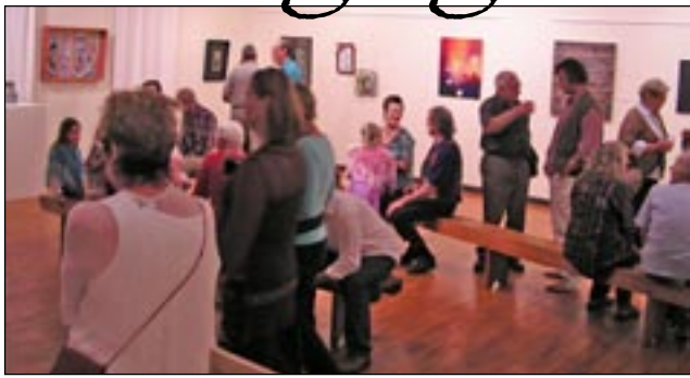
Opening of Through the Glass Darkly

The exhibition features a number of local and regional